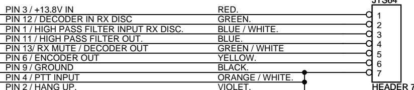
EXAMPLE 2: TS-64WDS ENCODE/DECODE WITH PL FILTER

PLEASE CONSULT THE COM-SPEC DATA SHEET FOR FURTHER INFORMATION OR PRODUCTION CHANGES THAT MAY AFFECT THEIR PRODUCT. COM SPEC CAN BE REACHED AT 800-854-0547