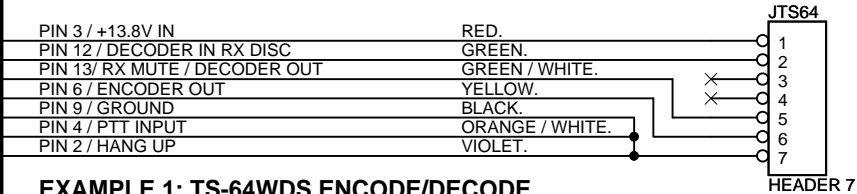
EXAMPLE 1: TS-64WDS ENCODE/DECODE ONLY WITHOUT PL FILTER OR REVERSE BURST

COM-SPEC TS-64WDS PLEASE CONSULT THE COM-SPEC DATA SHEET FOR FURTHER INFORMATION OR PRODUCTION CHANGES THAT MAY AFFECT THEIR PRODUCT. COM SPEC CAN BE REACHED AT 800-854-0547