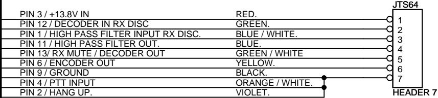
EXAMPLE 2: TS-64WDS ENCODE/DECODE WITH PL FILTER

COM-SPEC TS-64WDS PLEASE CONSULT THE COM-SPEC DATA SHEET FOR FURTHER INFORMATION OR PRODUCTION CHANGES THAT MAY AFFECT THEIR PRODUCT. COM SPEC CAN BE REACHED AT 800-854-0547